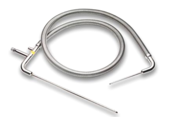
High Efficiency Transfer Hoses that minimize helium losses. Available in standard and custom configurations to meet your needs.