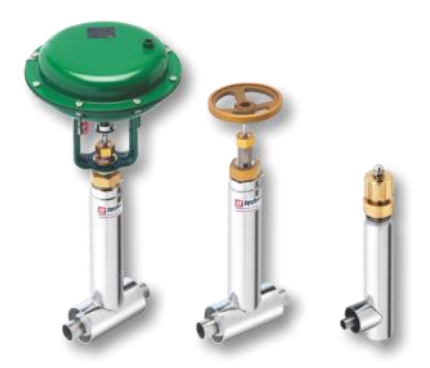
Vacuum Jacketed Valves integrated with transfer hoses or manifolds. We also sell valves separately.

Reduce your liquid helium losses with Technifab's high efficiency designs made for liquid helium. We can prove it! Technifab transfer lines, in a leading university report, outperformed our competition. Ask for a copy or visit our website.