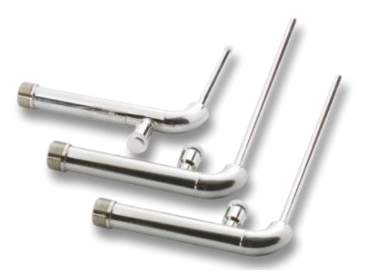
Liquid Helium Stingers to fill standard dewars, specialty equipment, and MRI units. Thin wall construction reduces cool down losses and total transfill time.

Technifab provides the most efficient line of vacuum jacketed low heat-leak liquid helium transfer equipment anywhere! Our products include: